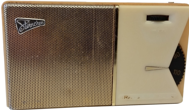
Taschenradio „Sternchen“ 1959