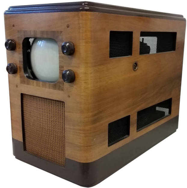
Fernsehgerät - Cossor Modell 54 England 1939

Prices are exclusive of installation, aerial equipment and aerial erection, but include Manufacturers' guarantee for 12 months.